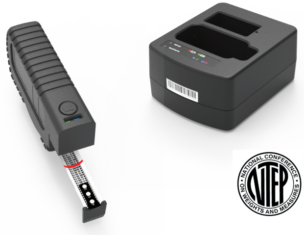
Cordless Scanning & Back Charge Protection for Shippers

Cubetape works readily with any shipping software (e.g. UPS WorldShip, FedEx Ship Manager, ADSI Ship-It, etc.) to eliminate the manual data entry of length, width and height. Besides reducing the labor burden brought on by the carrier dimensional weight changes, Cubetape accuracy eliminates the cost to your company of data entry errors. Cubetape also has value for LTL shipments since it can readily record the length, width and height of each pallet on a shipment. When printed on the Bill of Lading and signed by the driver, the dimensions can be valuable documentation to avoid post shipment billing adjustments by your carriers.